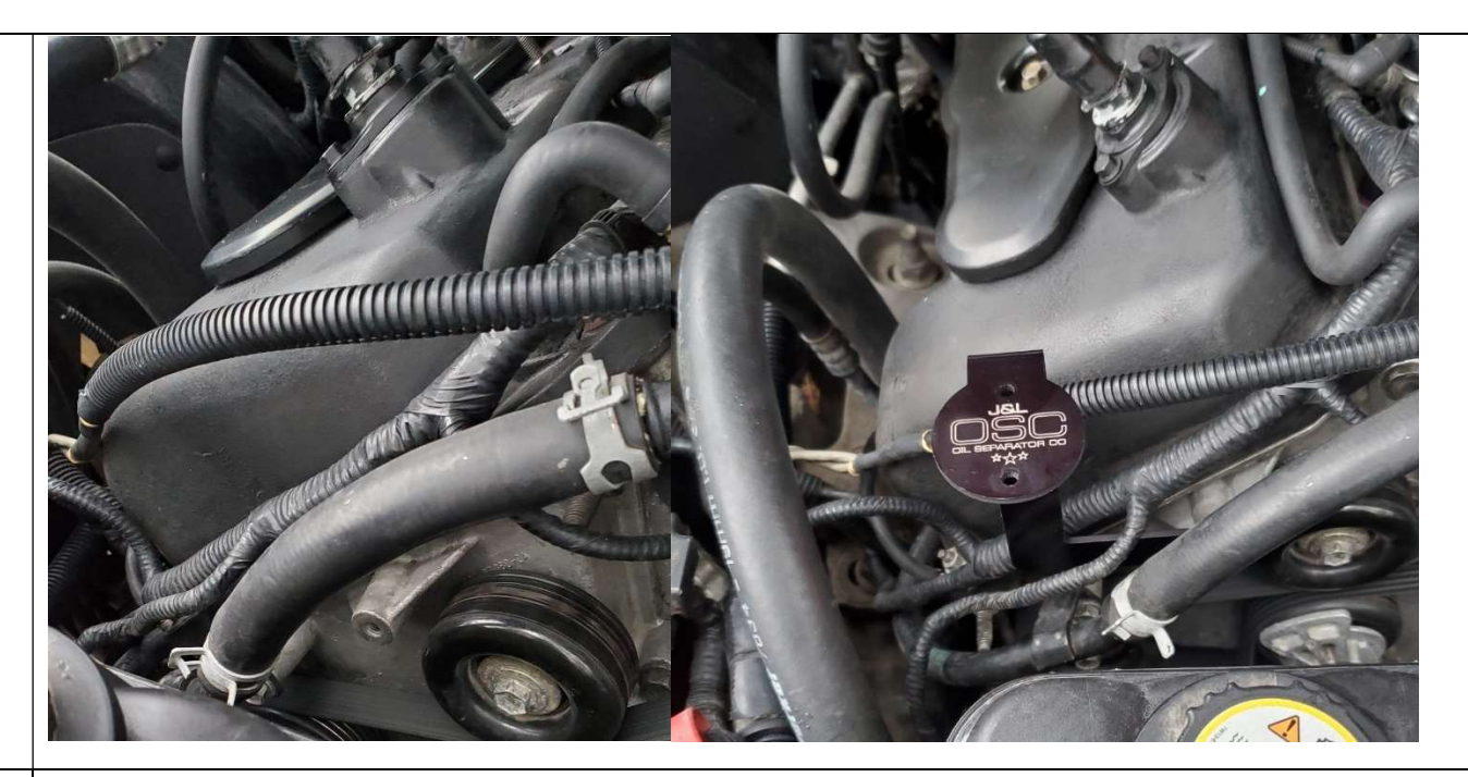
Mount J&L Oil Separator to the bracket with the supplied screws. Rotate PCV connection on valve cover to face oil separator. Lubricate connections with grease or light oil, this will help them slide fully into place. Hoses on the oil separator can twist on their respective fittings to change the angle of the hose for better layout.